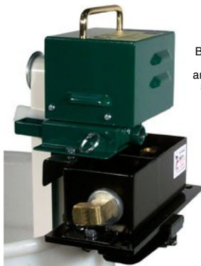
Belt Skimmer, Diverter,™ and Lockjaw™ shown here